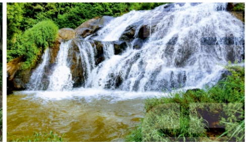
CATHRINE WATER FALLS : 11 Kms