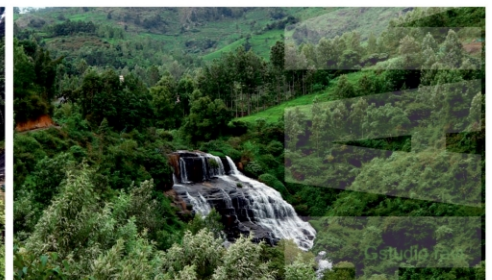
ELK FALLS : 36 Kms