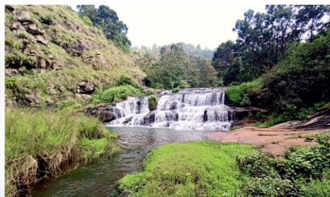
SUNDATTY WATER FALLS : 17.7 Kms