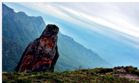
RANGASWAMY PILLAR AND ROCK : 18 Kms