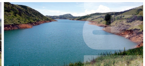
UPPER BHAVANI : 48 Kms