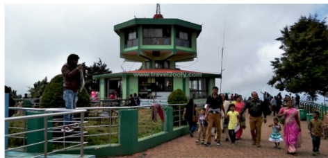
DODDABETTA : 10 Kms