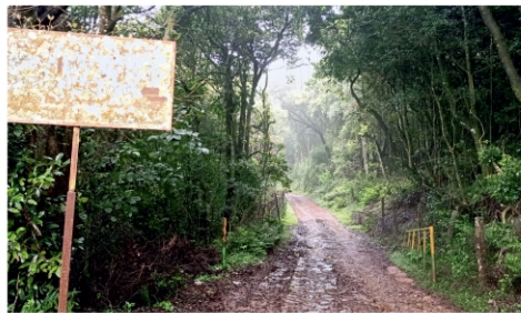
LONG WOOD SHOLA : 8 Kms