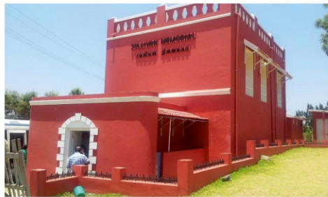
JOHN SULLIVAN BUNGALOW : 3.6 Kms

METTUPALAYAM: 29 Kms | BANGALORE: 307 Kms | CHENNAI: 534 Kms