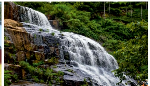
UYILATTY WATERFALLS : 8.2 Kms