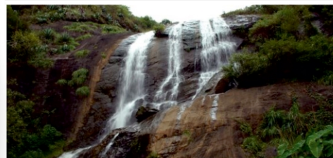
KALLATTY FALLS : 13 Kms