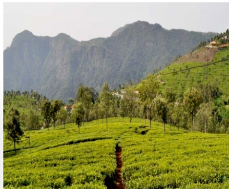
LADY CANNING'S SEAT : 9 Kms