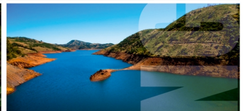
AVALANCHE : 28 Kms