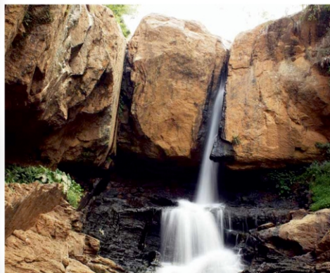
LAWS FALLS : 7Kms