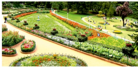
BOTANICAL GARDEN : 3.6 Kms (With in Town)

METTUPALAYAM: 51.2 Kms | BANGALORE: 265 Kms | CHENNAI: 555.5 Kms