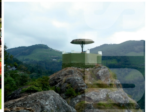
LAMBS ROCK : 6.5 Kms