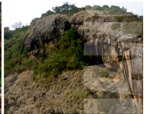
DROOG : 15Kms