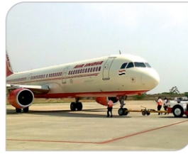
AIR PORT 70.7 Kms