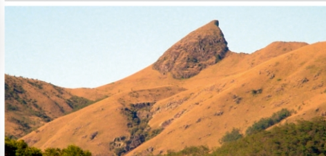
MUKRUTHI PEAK : 40 Kms

No. 5/32, Thabaacombai, Kotagiri - 643 217.