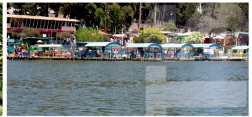
OOTY LAKE (With in Town)