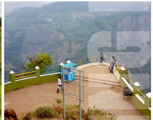
DOLPINS NOSE : 12Kms