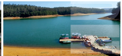
PYKARA LAKE : 21 Kms