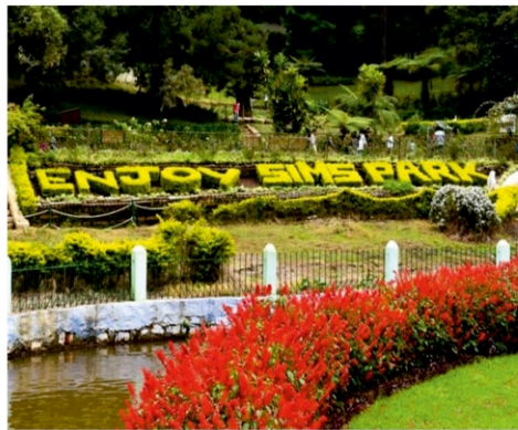
SIMS PARK (With in Town)

METTUPALAYAM: 34.5 Kms | BANGALORE: 284.6 Kms | CHENNAI: 538.8 Kms