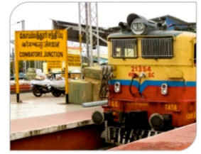
RAILWAY STATION 70.9 Kms

METTUPALAYAM: 34.5 Kms | BANGALORE: 284.6 Kms | CHENNAI: 538.8 Kms